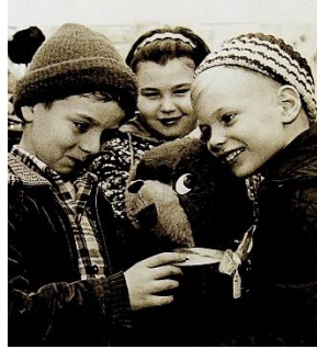
Stuffed Bear Holiday Gift

The Development Department is asking that any donations be received by December 16 th and should be mailed to: 1863 Bethany Road, Womelsdorf, Pa. 19567