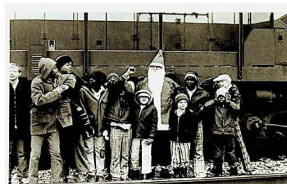
Santa & the Train